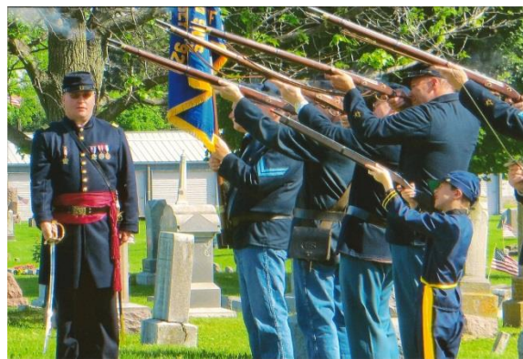
Company C, 20th O.V.I. fires a musket salute at the Lees Creek Cemetery