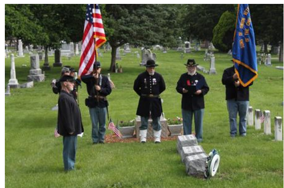
Same as Above